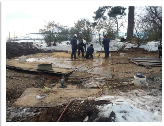
Bottom of the "barrel."