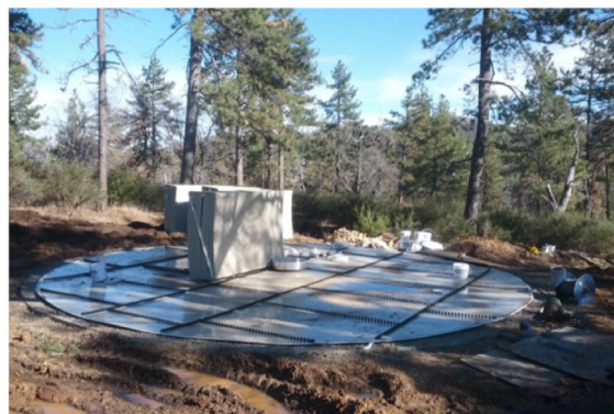
New floor for the water tank,