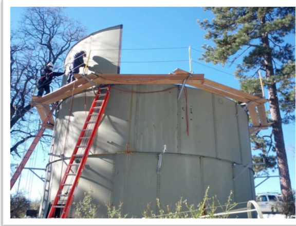
Dismantling the tank.