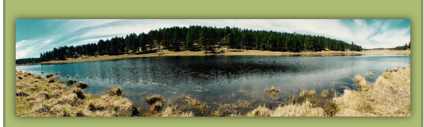
Big Laguna Lake, March 10, 2017 Eugenie Newton