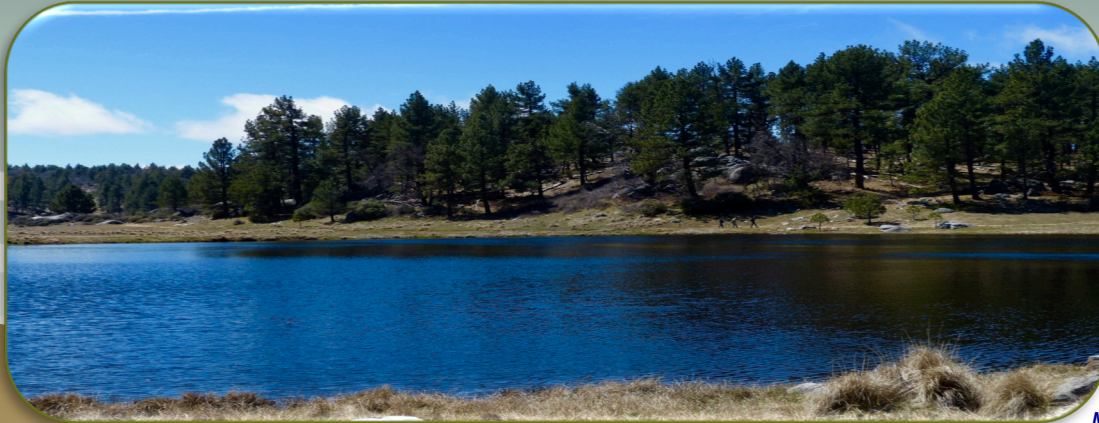
Big Laguna March 28, 2019