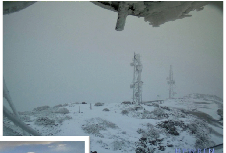
February 21, 2019, 5:15pm View East