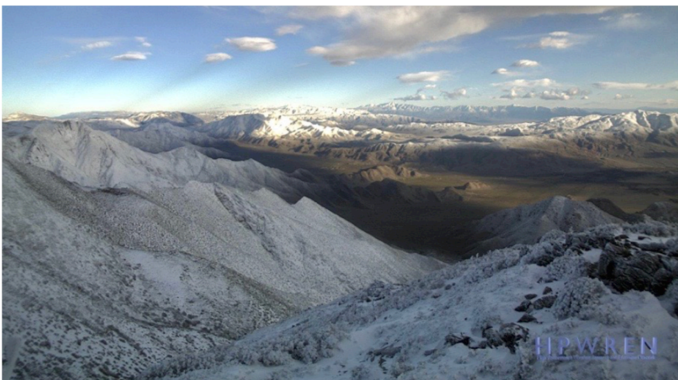
February 22, 2019, 7:30 am View North