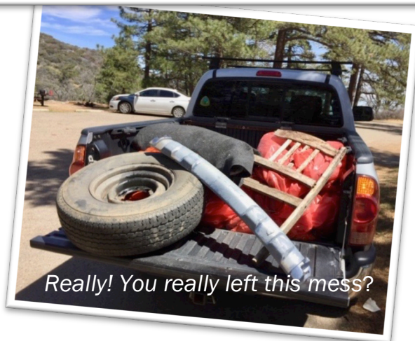
Really! You really left this mess?