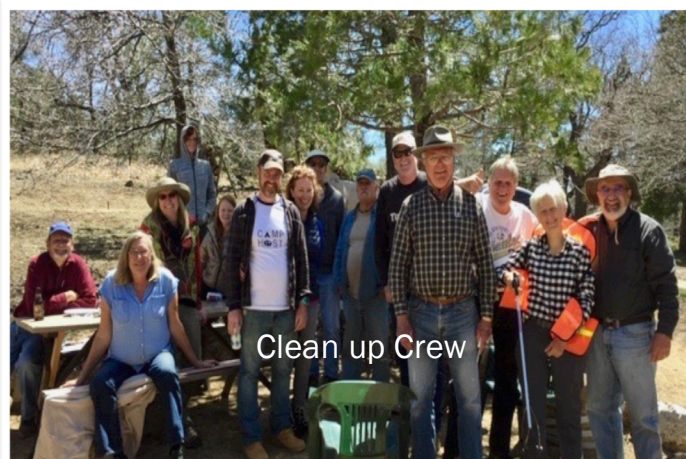
Clean up Crew