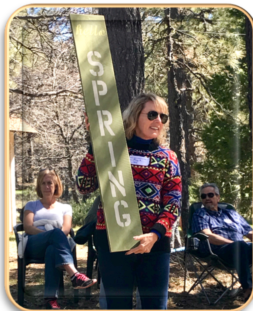
Hoping for Spring!