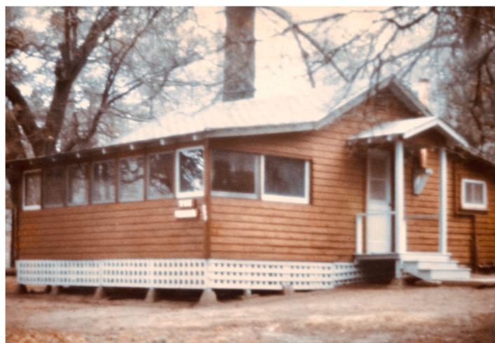
Mid-1970's. Sign on the front says The Pennicks , aka El Tee Pee . Note the large pine behind cabin in both photos. It later fell between 330 and the cabin next door.