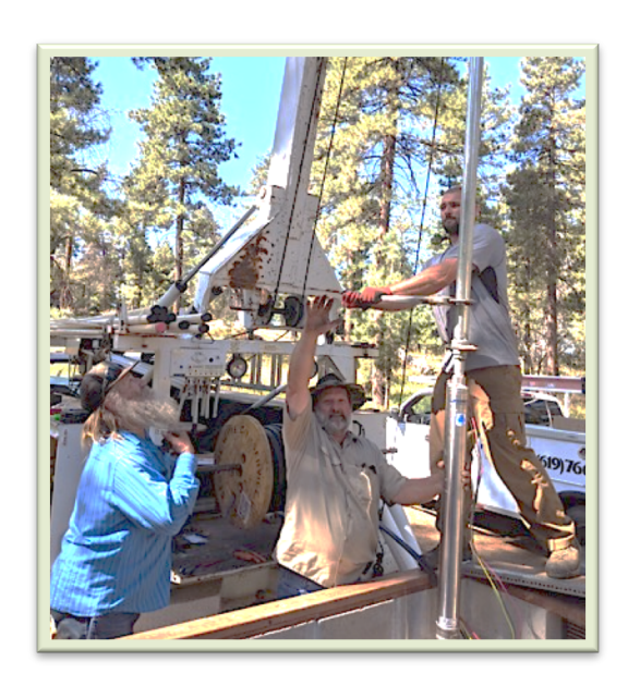
Installing the new well pump

A year ago I asked the Board to review our