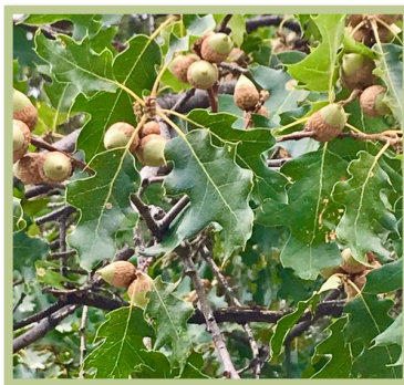
Acorns on oaks at Visitor Center

Bumper crops of acorns are known as "mast" years. They occur every 2 to 5 years, but scientists haven't learned yet what causes them or how to predict them. In a mast year a very large oak can produce up to 10,000 acorns. Amazing!