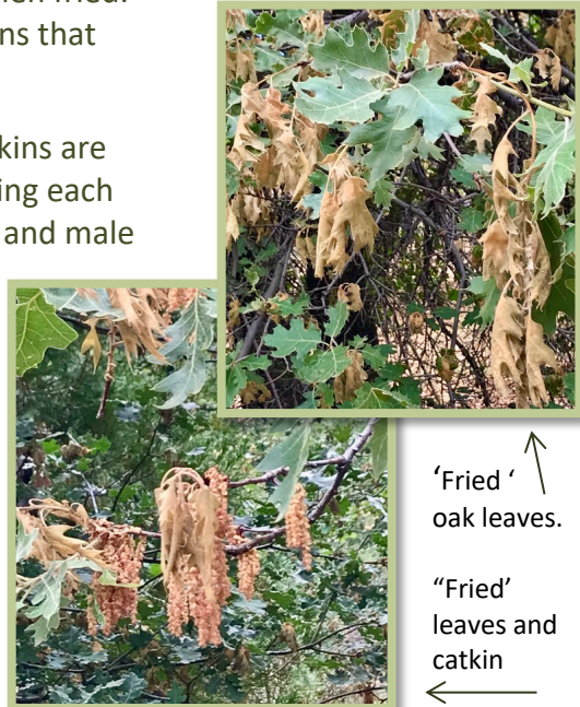
↑ 'Fried' oak leaves.