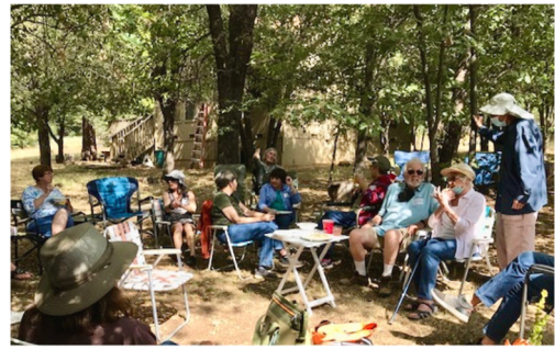
Finally getting together!!