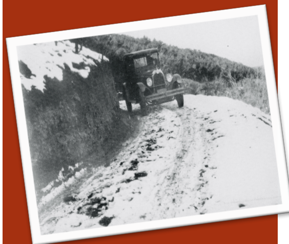
“Images of America, Cleveland National Forest” by James Newland. Arcadia Publishing, 2008, p 57

Car navigating the ‘new Laguna Road’ in 1920. Originally a 12’ wide single track road built for $39,078.32!