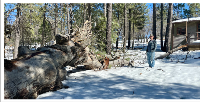
Tom next to huge old oak downed by the storms.