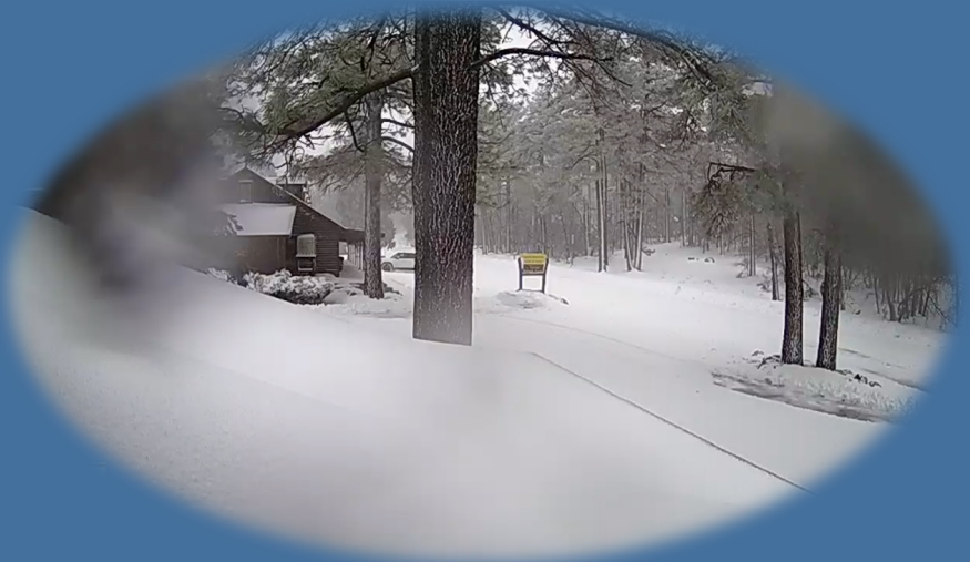
Mount Laguna Lodge Webcam March 30, 2023