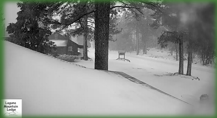
Laguna Lodge Webcam, Apr 5, 2024

Founded in 1935, the Mount Laguna Improvement Association acts as a liaison between the cabin owners and the Forest Service addressing water, roads and wood removal.