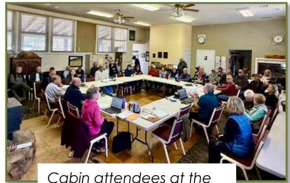
Cabin attendees at the March 22 meeting.

Ole tank refurbishment: On February 22, 2025, the MLIA board held an informational zoom meeting for our cabin community. The purpose of the meeting was to outline the need to refurbish the Ole tank and why it was urgent. Over the course of the meeting, I outlined the findings of three different reports and their recommendations to refurbish the tank. I spent about half the meeting answering questions from cabin owners and the following month answering additional questions that were not answered during the meeting. We published the questions and our answers in our attempt to be fully transparent.