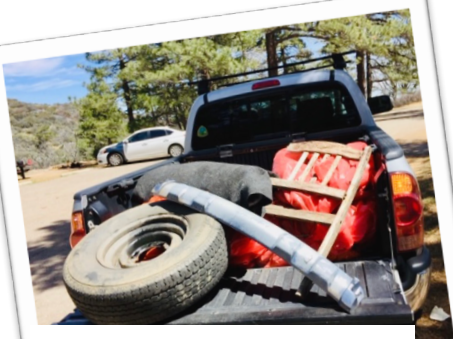
Junk from Sunrise Highway