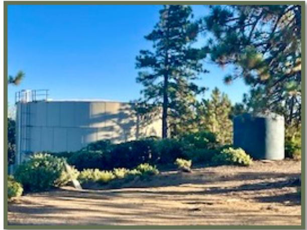
Current Ole tank (left) and smaller 5000 gallon temporary tank (right).

Lastly, the social events MLIA and Fire Safe Council host on our mountain foster a sense of community. If you haven't yet attended one, please come and see what they're about. It's a chance to meet people, have fun and have some really good food.